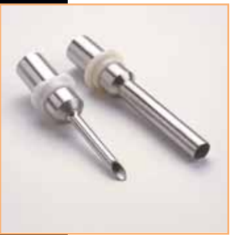
Plain and Cannoli Spouts

Balancer Assy. Hose Assy. and Foot Switch