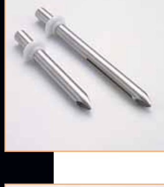
Standard and Eclair Spouts