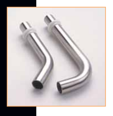
45° & 90° Spouts

Heaters for Stainless Steel Filler Units