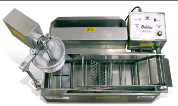
Donut Robot® Mark II Gas