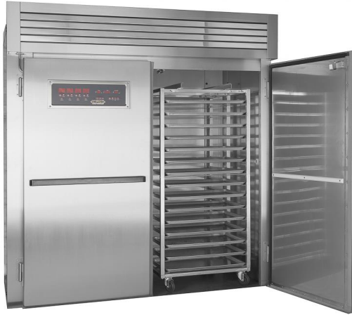
Model LRP2S-40 Shown (rack not included)