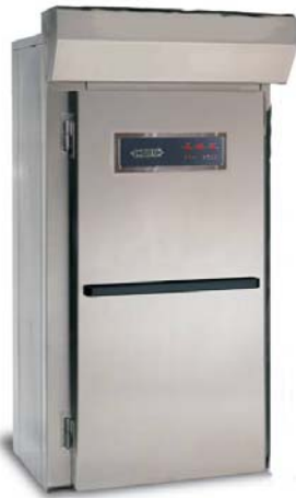
Model LRPR1-40HO Shown