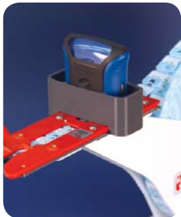
P18-00163 PRINTER (1002F Model C)