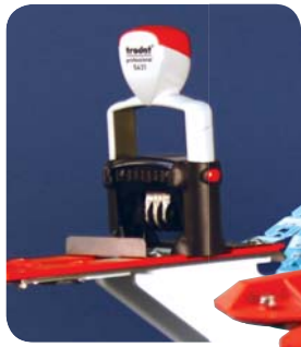
P18-00094 PRINTER (1002F Model D)