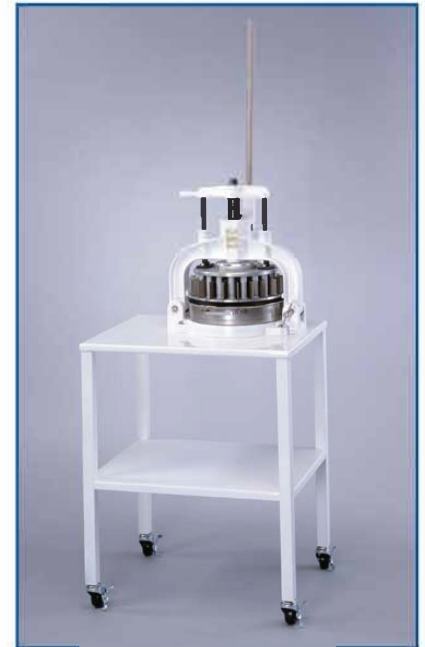
623 with Optional Stand